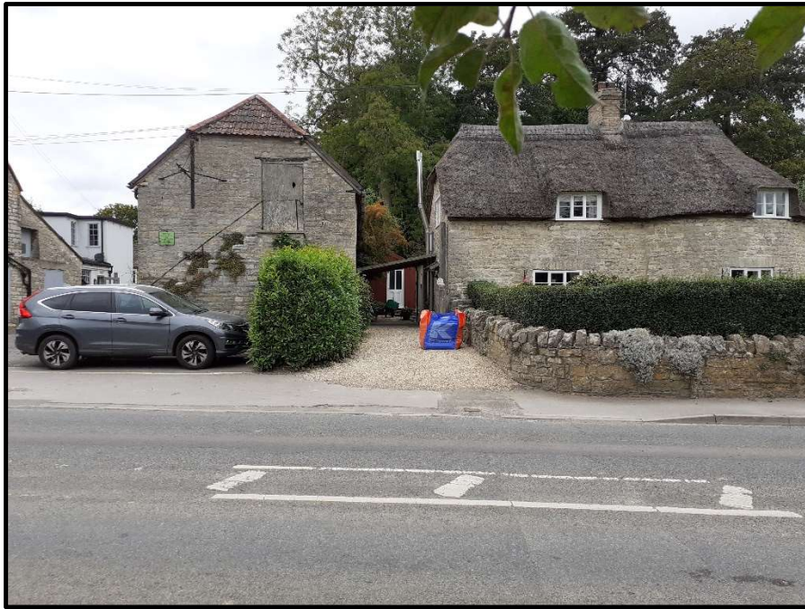
Photograph 19, looking at point D1