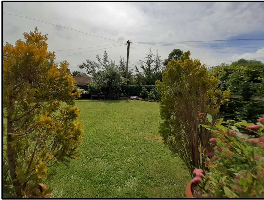
Photograph 17, close to point D looking towards D.