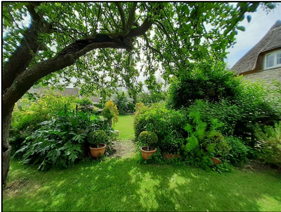
Photograph 16, between points C4 and D looking towards D