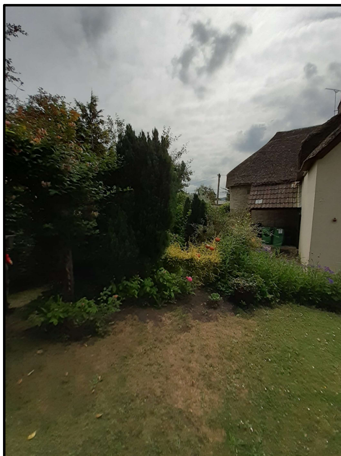
Photograph 14, between points C4 and D looking towards D.