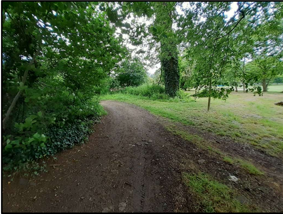
Photograph 1, at point C looking south-west