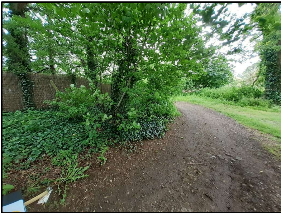
Photograph 2, at point C looking south-east