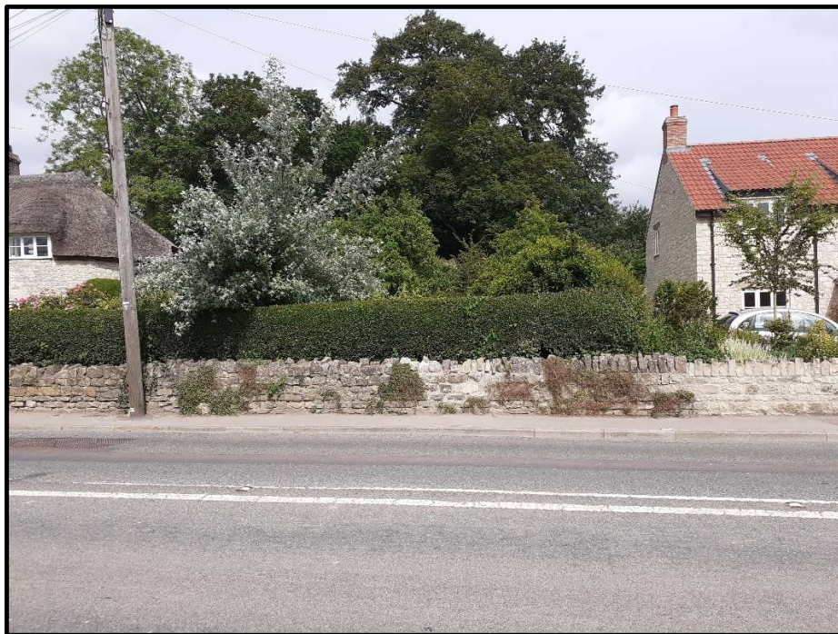
Photograph 18, looking at point D from the other side of the road