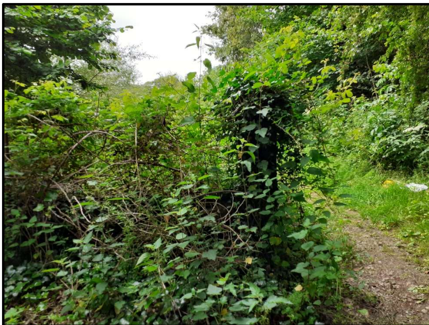
Photograph 5, at point C1 looking north-west