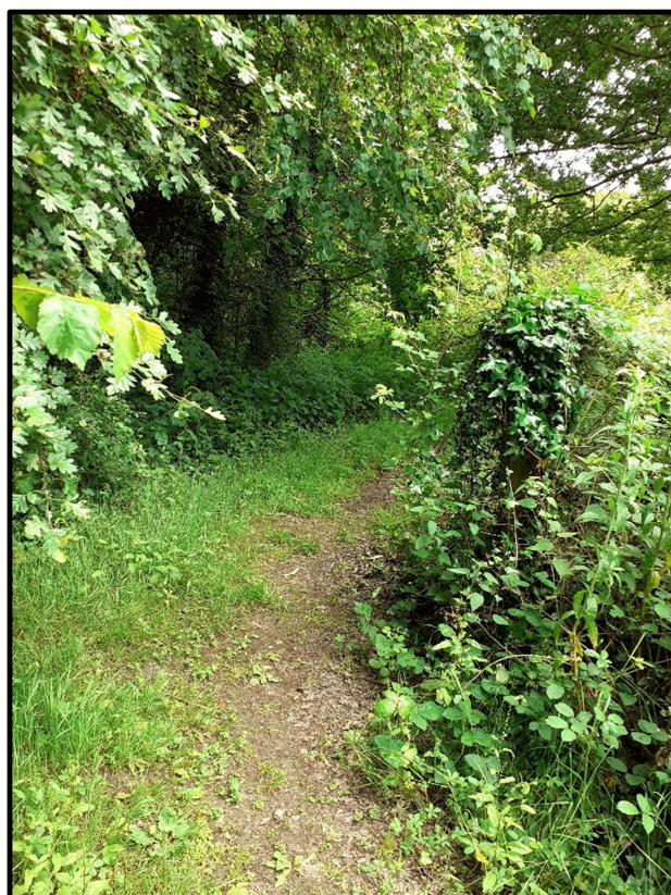
Photograph 6, at point C1 looking south-east