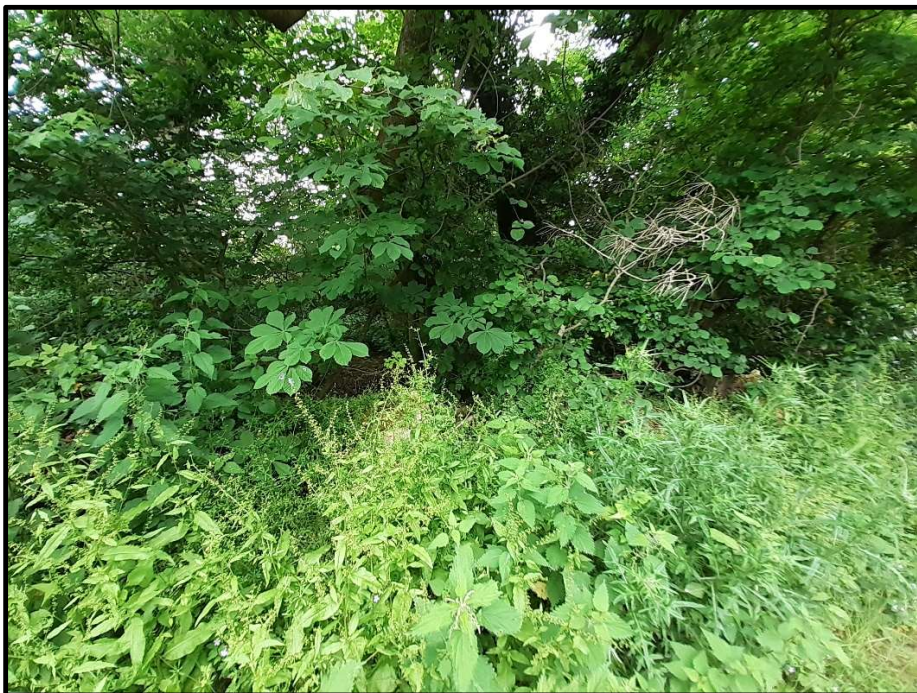
Photograph 4, just south of point C looking towards the east side boundary