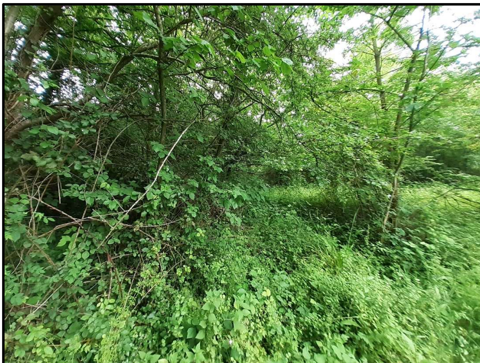
Photograph 9, between C1 and C2, looking south-east