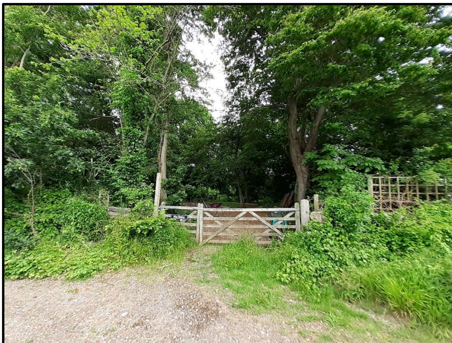
Photograph 13, from the site of the former cattle pens looking across the garden boundary of the claimed route