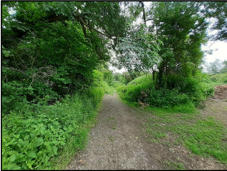
Photograph 3, just south of point C looking south-east