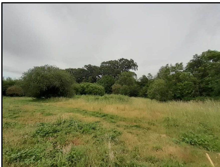
Photograph 8, standing to the west of the route looking across open ground towards the east side boundary trees, between points C1 and C2.