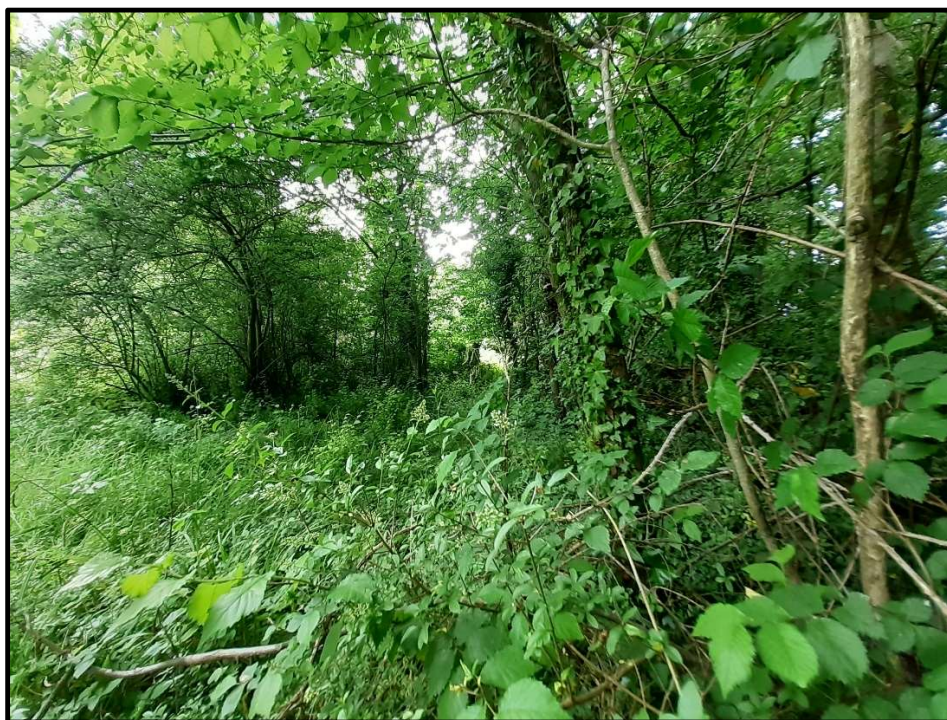
Photograph 10, between C1 and C2, looking north-west