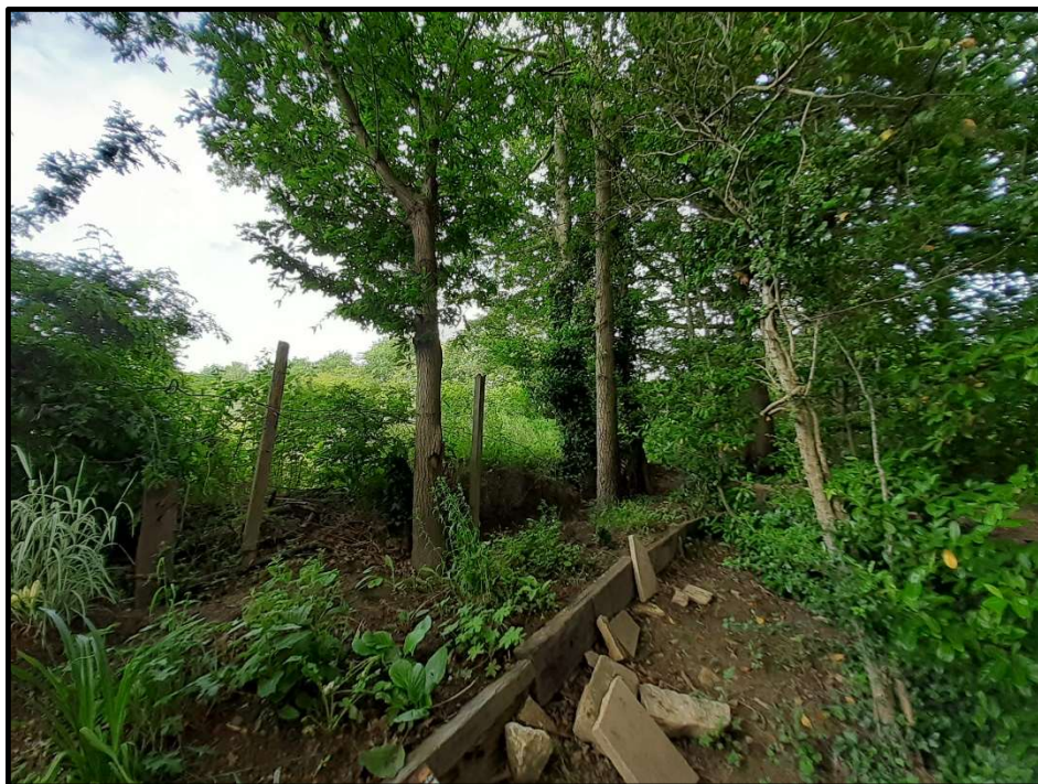
Photograph 12, between points C3 and C4 looking towards C3