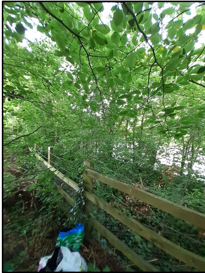
Photograph 11, at point C3 looking north-west