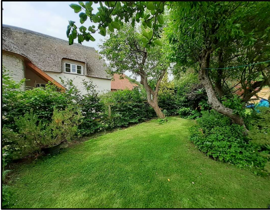
Photograph 15, between points C4 and D looking towards C4